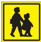
Parents as Partners

Mon 11 th ~ Friends of the School Film Night Fri 22 nd ~ Ladybirds Trip to Cadburys World Mon 25 th to Fri 29 th ~ Mothers Days Lunch Week Tues 26 th ~ HI5 Netball Event for Selected Pupils